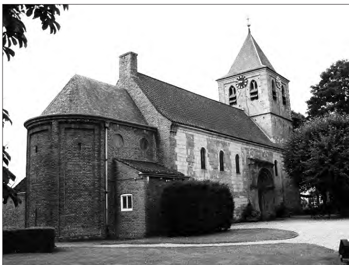
The Old Church Oosterbeek.

were taken care of in this church from the 10th century. Nowadays the church has become a pilgrimage for the veterans.