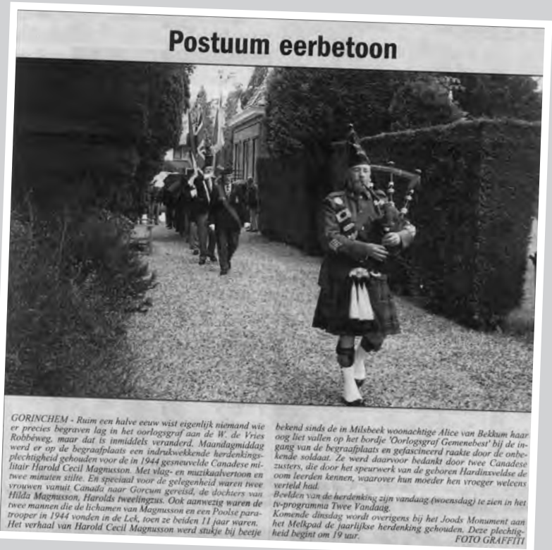
Local Newspaper Gorcum 15-09-2004.