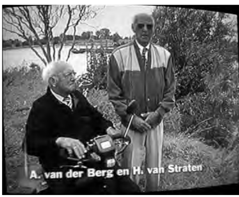
Images TV broadcast.