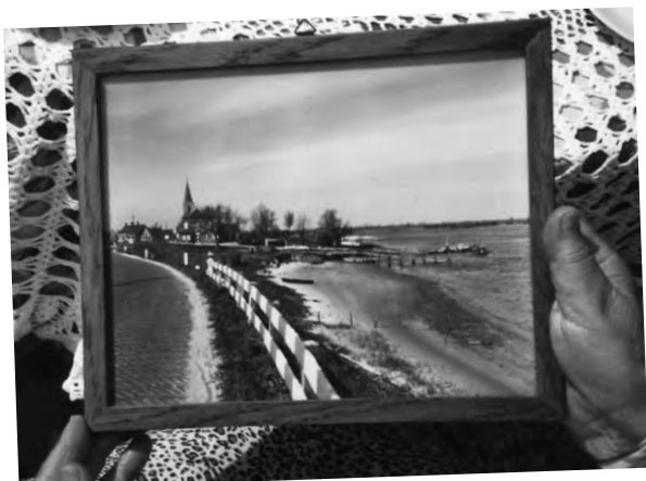
They showed an old picture of the ferry.